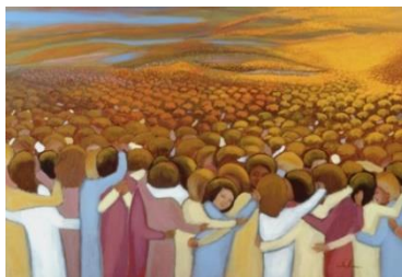
Saints of God

Prayer: Loving and gracious God, throughout the ages you have called men and women into relationship with you; you have guided and sustained and protected your people; you have loved and forgiven them, and your Holy Spirit has worked in and through them to minister to others.