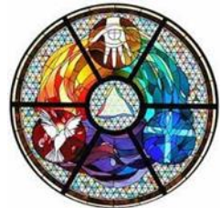
'Trinity Window,' Saint Gabriel of the Sorrowful Mother, Avondale, Pennsylvania

We cannot fully explain or understand God, but we can know God through our experience of God in our lives. It might be easier to understand the doctrine of the trinity if it is not heard as a dogmatic factual statement, but an expression of the truth of relationship. Father, Son and Spirit are one, held together in love, and we too are invited into this relationship, into the presence of God, to live in God, one with God, in love. And we are called to share that mystery of love with others.