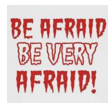
tag line from the 1986 film The Fly

We, and our young people, are receiving contrasting messages about life and our attitude toward it. We need to help them find their way between extremes. Halloween may be a good time to start the conversation.