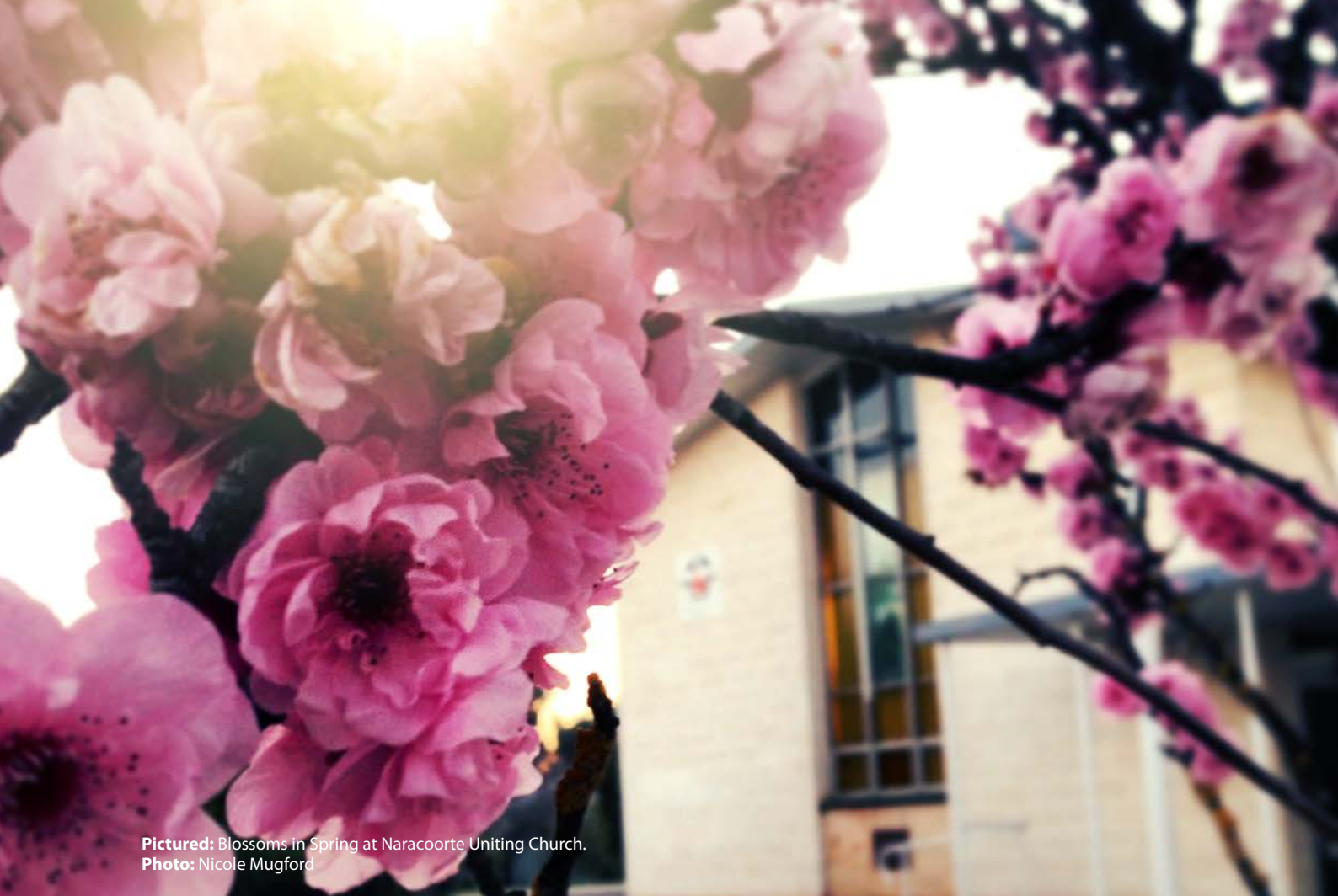
Pictured: Blossoms in Spring at Naracoorte Uniting Church.